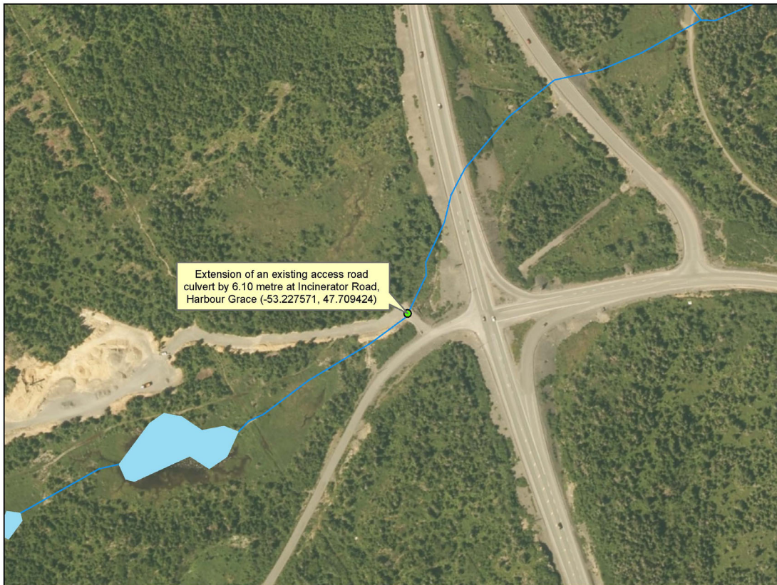
Extension of an existing access road culvert at Incinerator Road, Harbour Grace