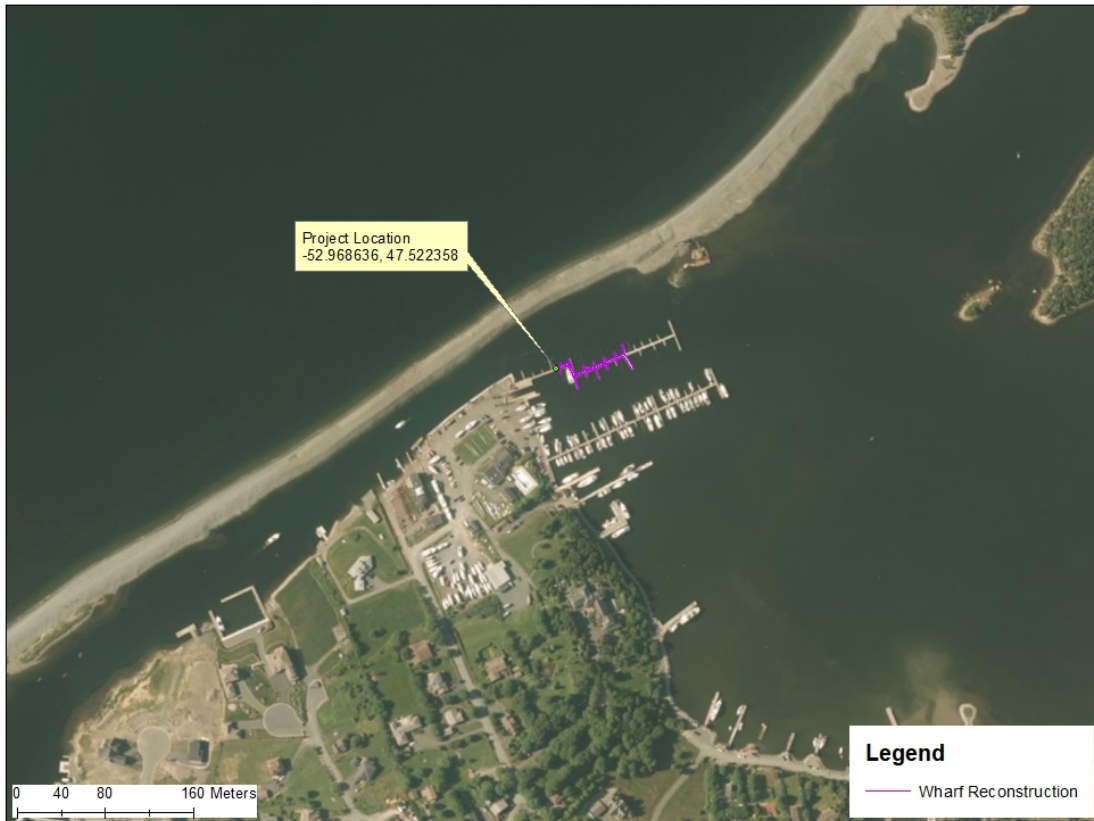
Town of Conception Bay South (Long Pond) - Royal NL Yacht Club - North Wharf Reconstruction