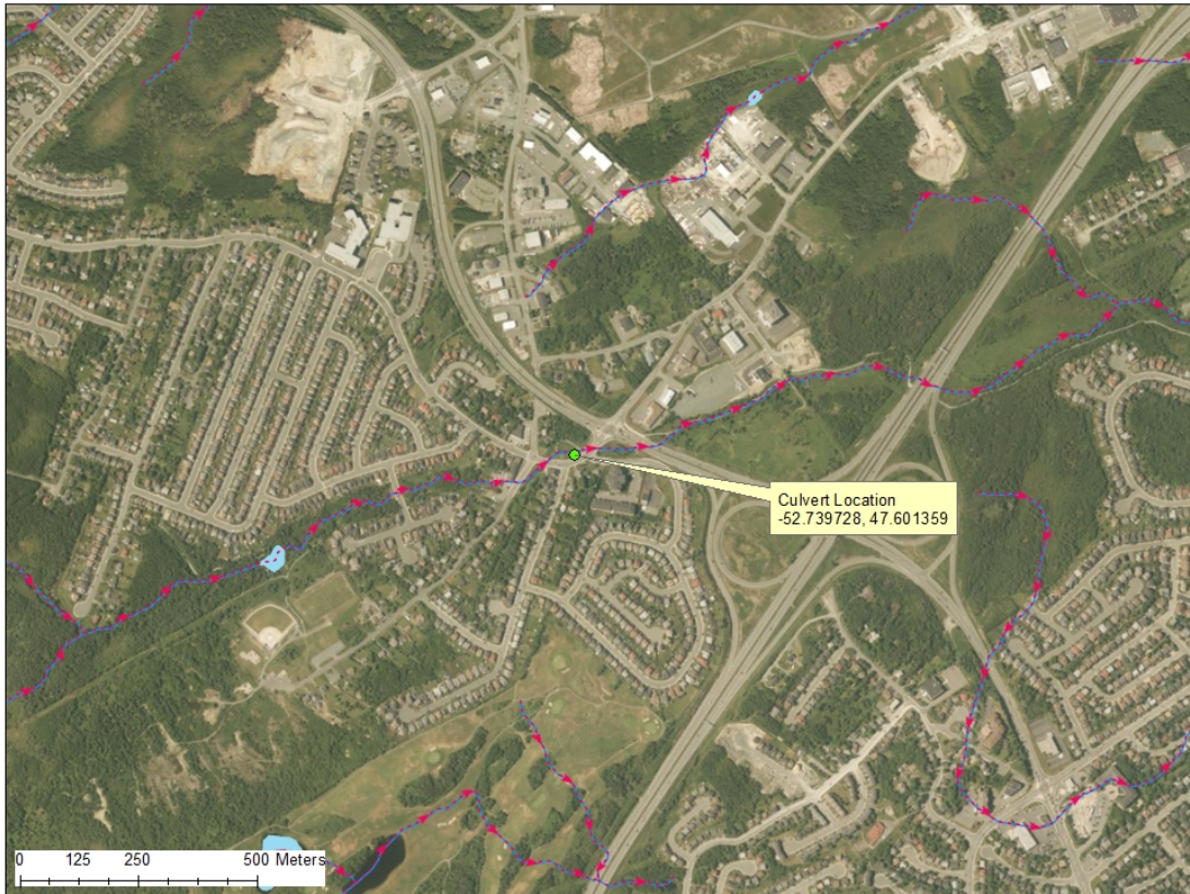
City of St. John's (Virgina River) - Rhodora Street & Airport Heights Drive - Culvert Repair