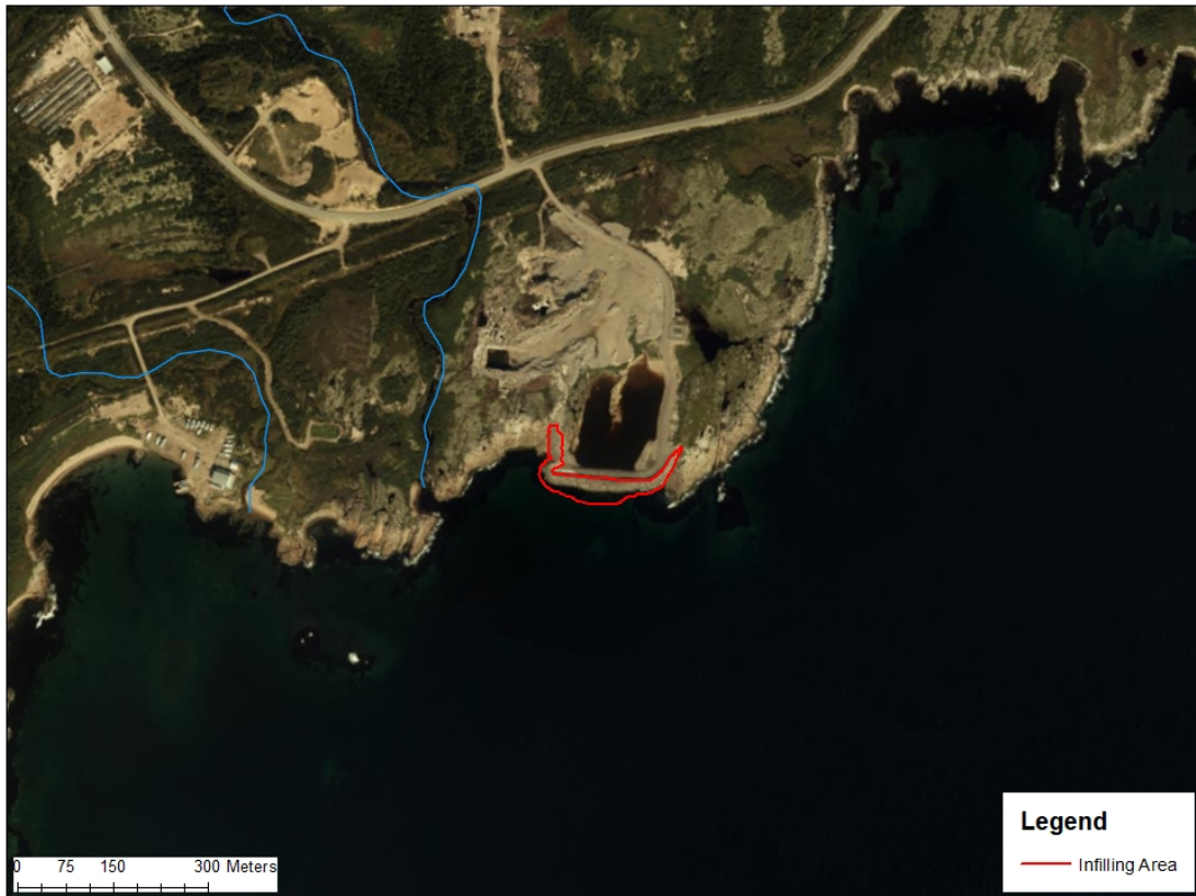
L'Anse-au-Diable (Straight of Belle Isle) - Breakwater Repairs