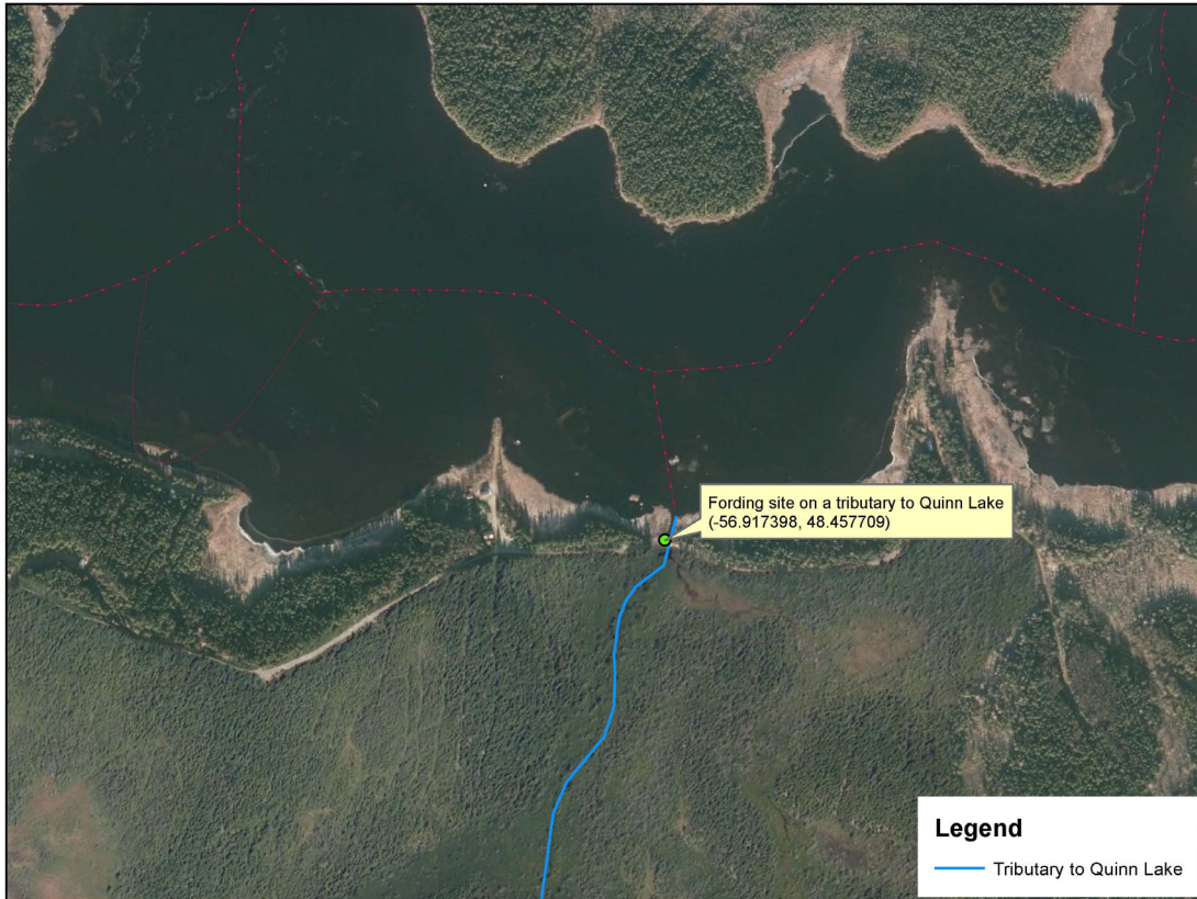
Fording site on a tributary to Quinn Lake, Valentine Gold Project