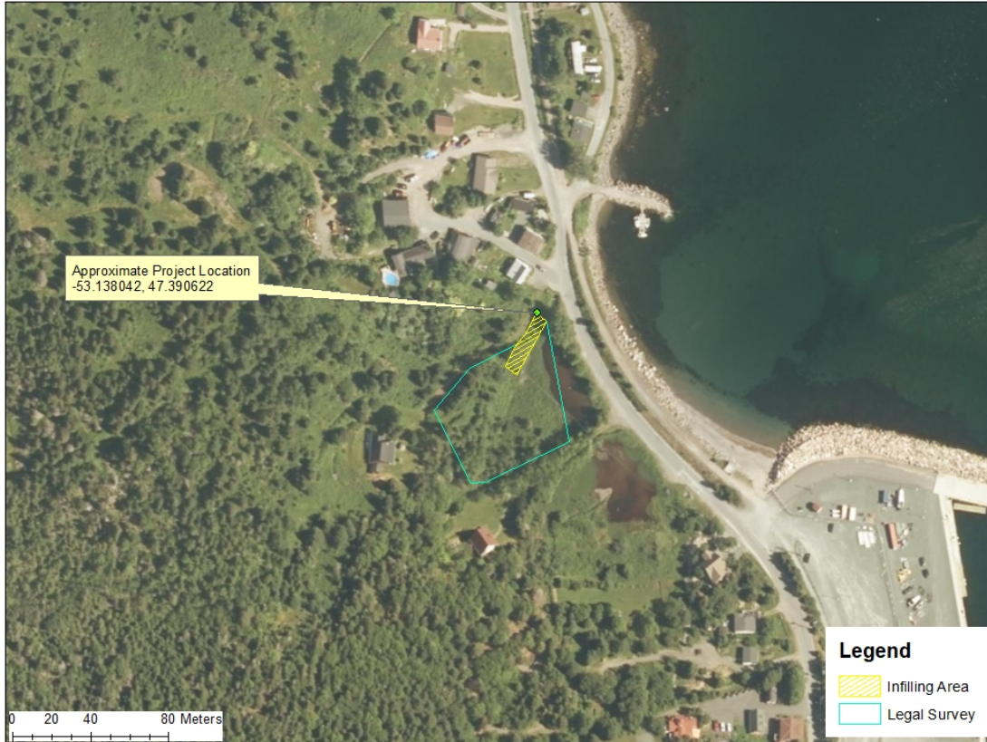
Town of Holyrood (Unnamed Waterbody) - Driveway Construction