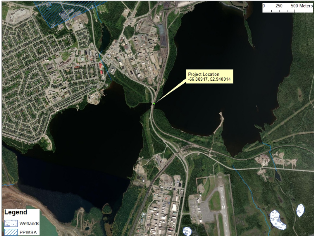
Labrador City (Wabush Lake) - Geotechnical Drilling