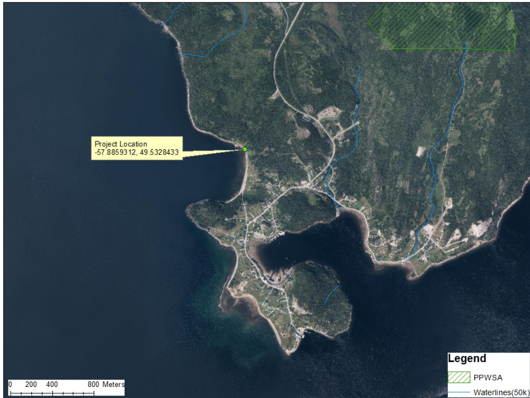
Town of Norris Point (Wild Cove) - Boathouse and Wharf Reconstruction