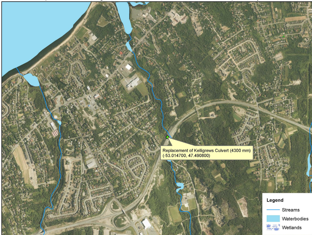
Replacement of Kelligrews River Culvert in Route 2 near Conception Bay South