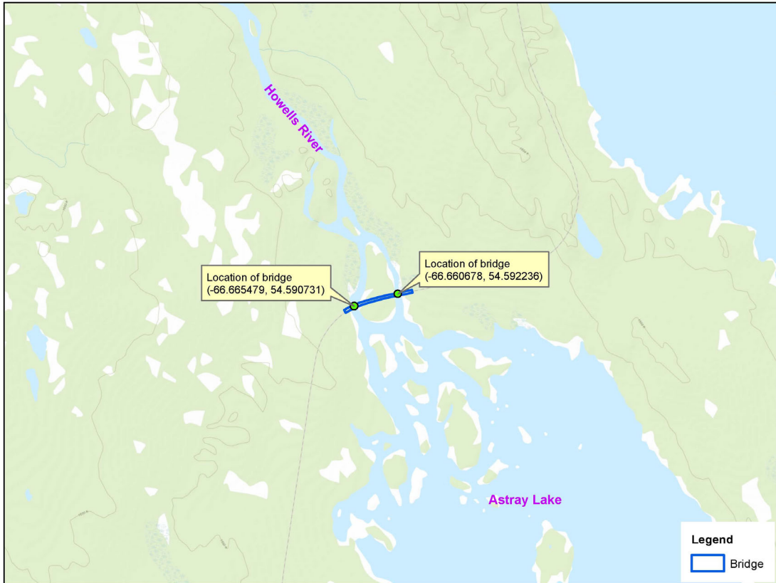
Repairing and maintenance of Tshuetin Rail Transportation Howells Bridge