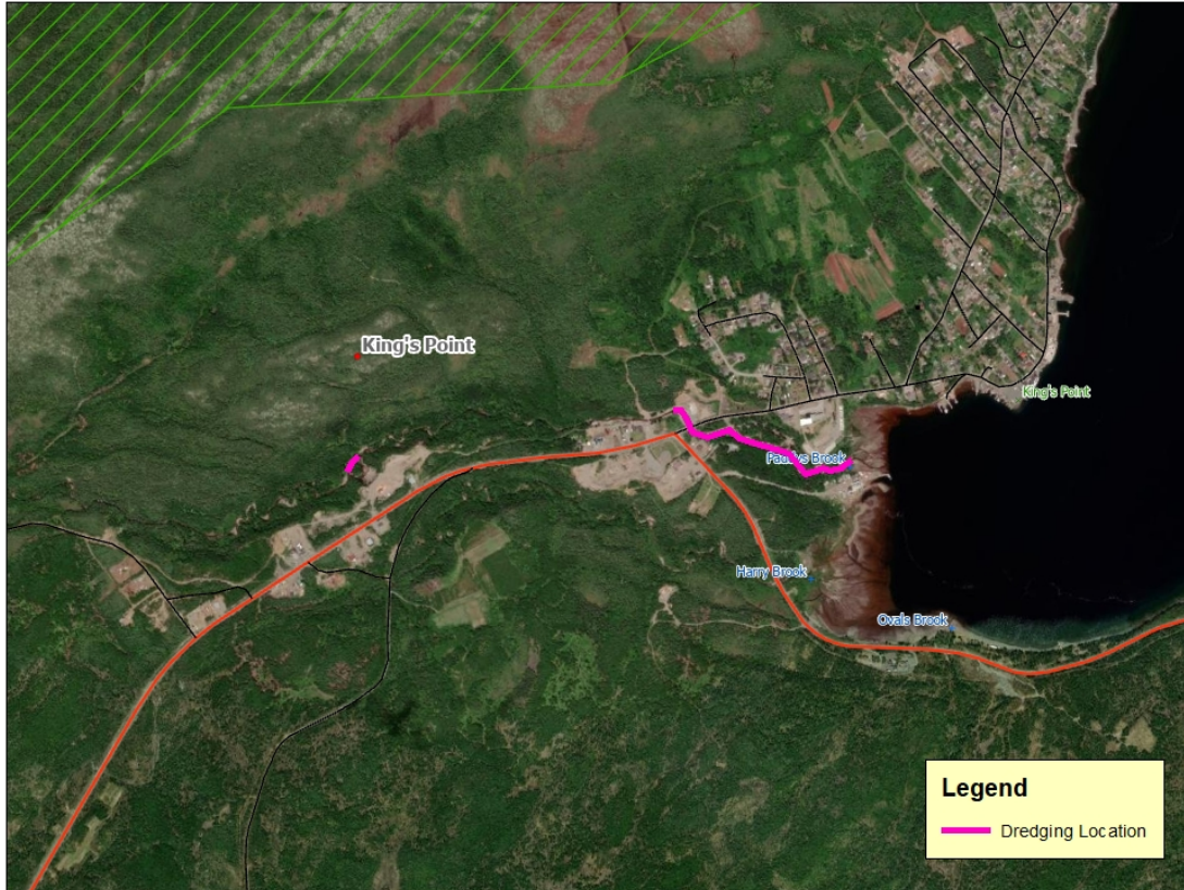
Paddy's Brook - Dredging and Armour Stone