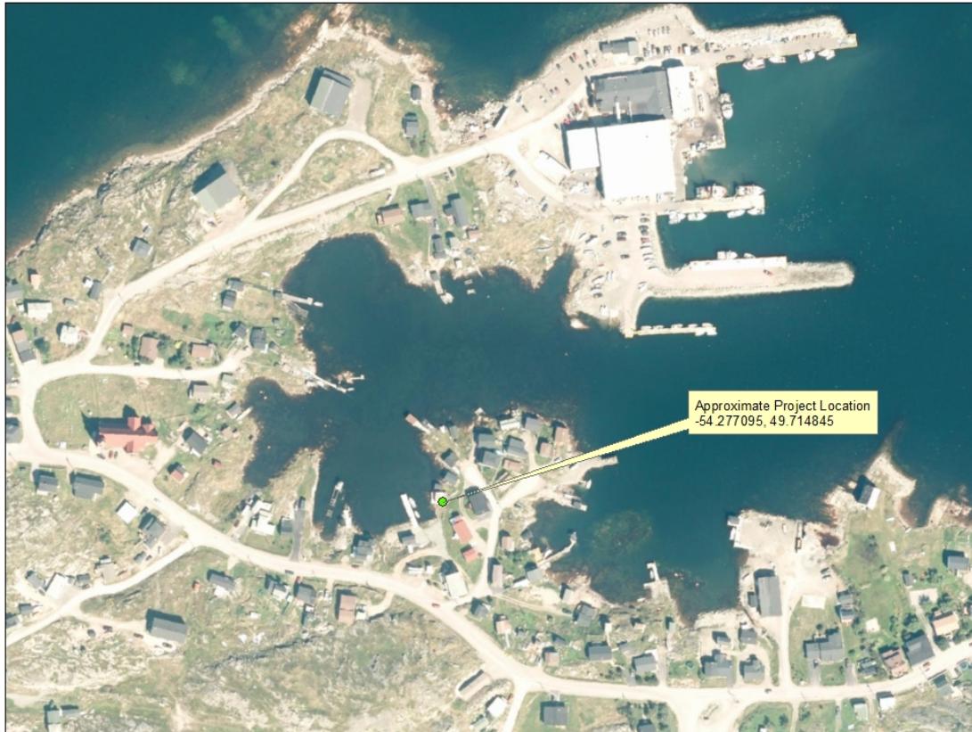
Town of Fogo Island (Little Harbour) - Residential Dwelling Improvements