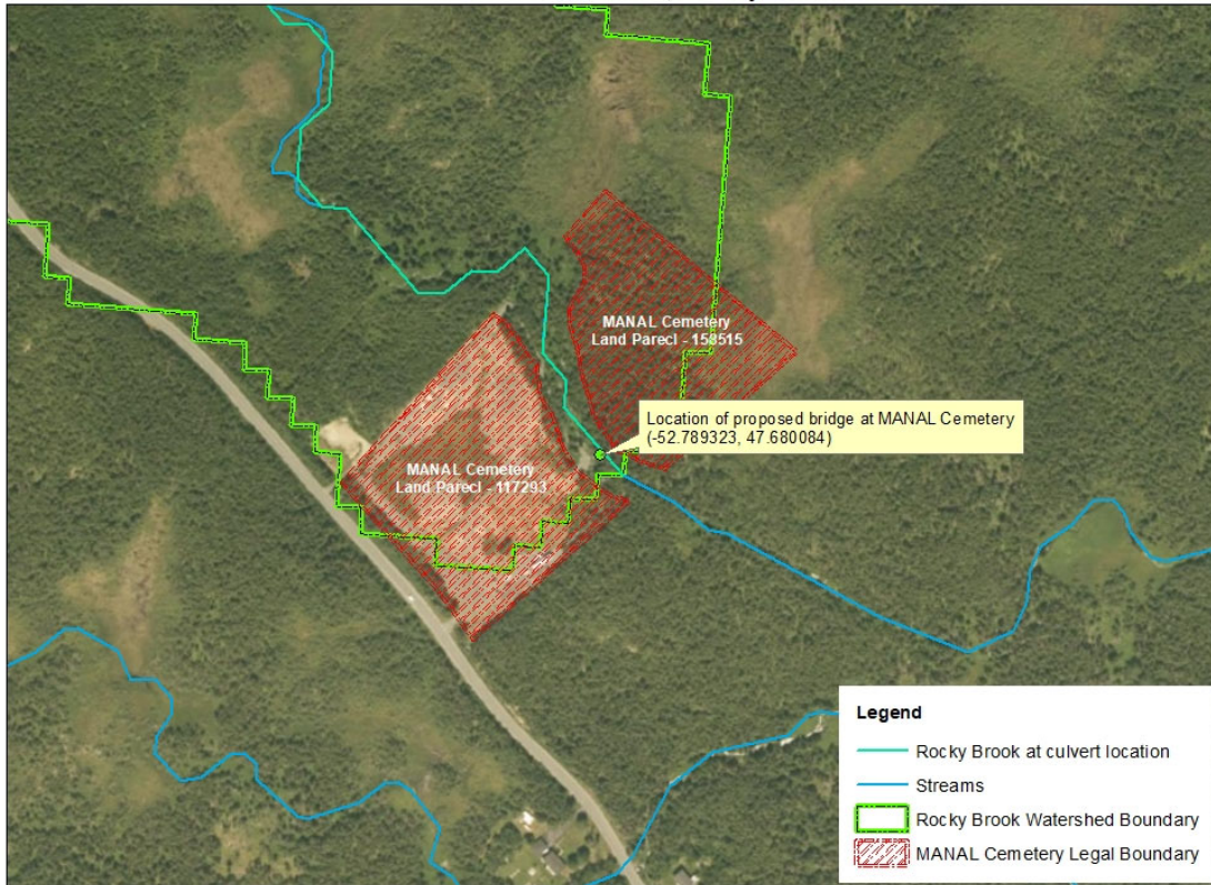
Bridge Installation at Muslim Association of Newfoundland and Labrador Cemetery (MANAL) 636 Bauline Line, Torbay