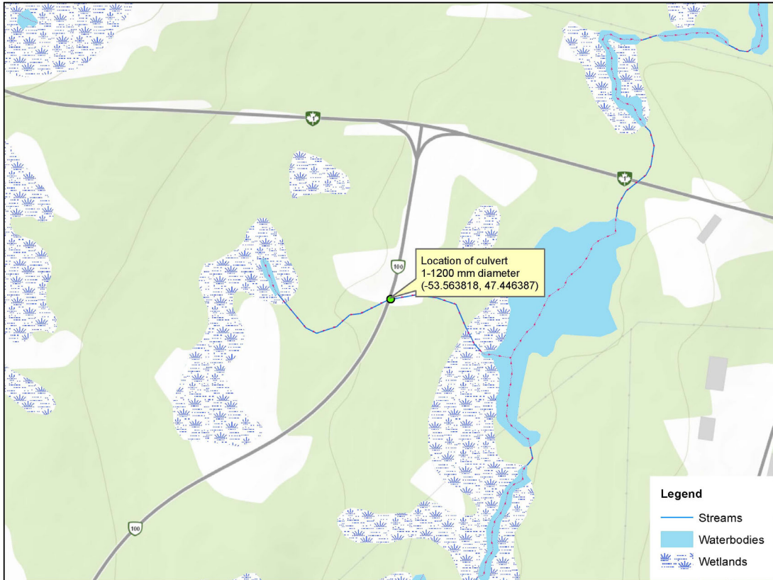
Replacement of a culvert at km 0.45 on route 100 near Whitbourne