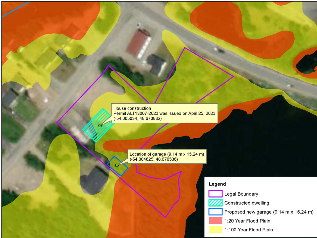
Garage Construction at 3-5 Angle Brook Road, Glovertown