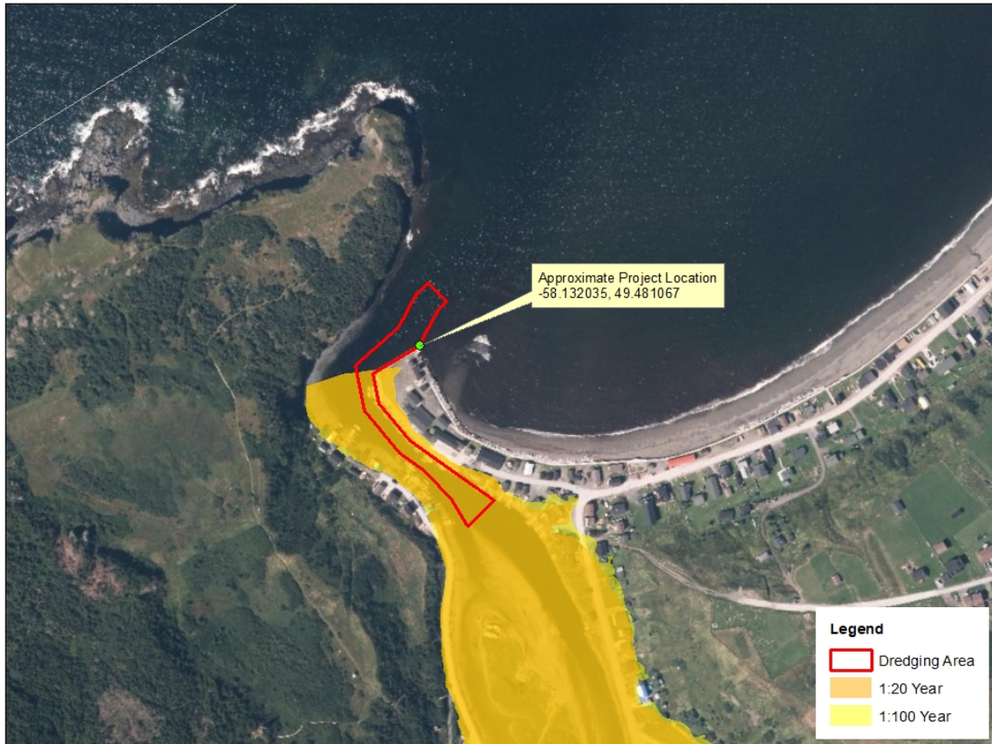
Town of Trout River (Trout River) - Channel Dredging in Flood Plain