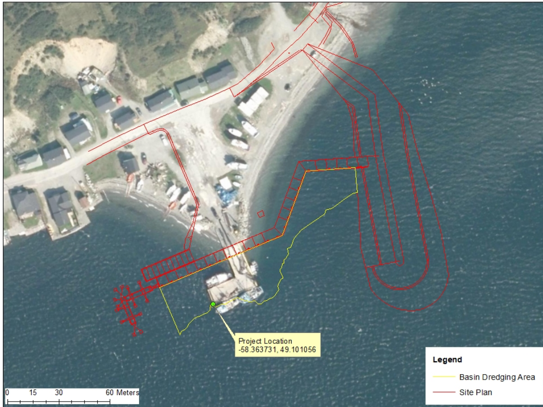
Town of Lark Harbour (Lark Harbour) - Small Craft Harbour Development