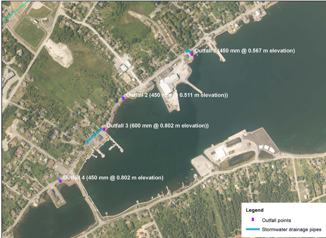
Upgrading of four (4) stormwater outfalls along the shoreline of Bay Roberts Harbour Water Street, Bay Roberts