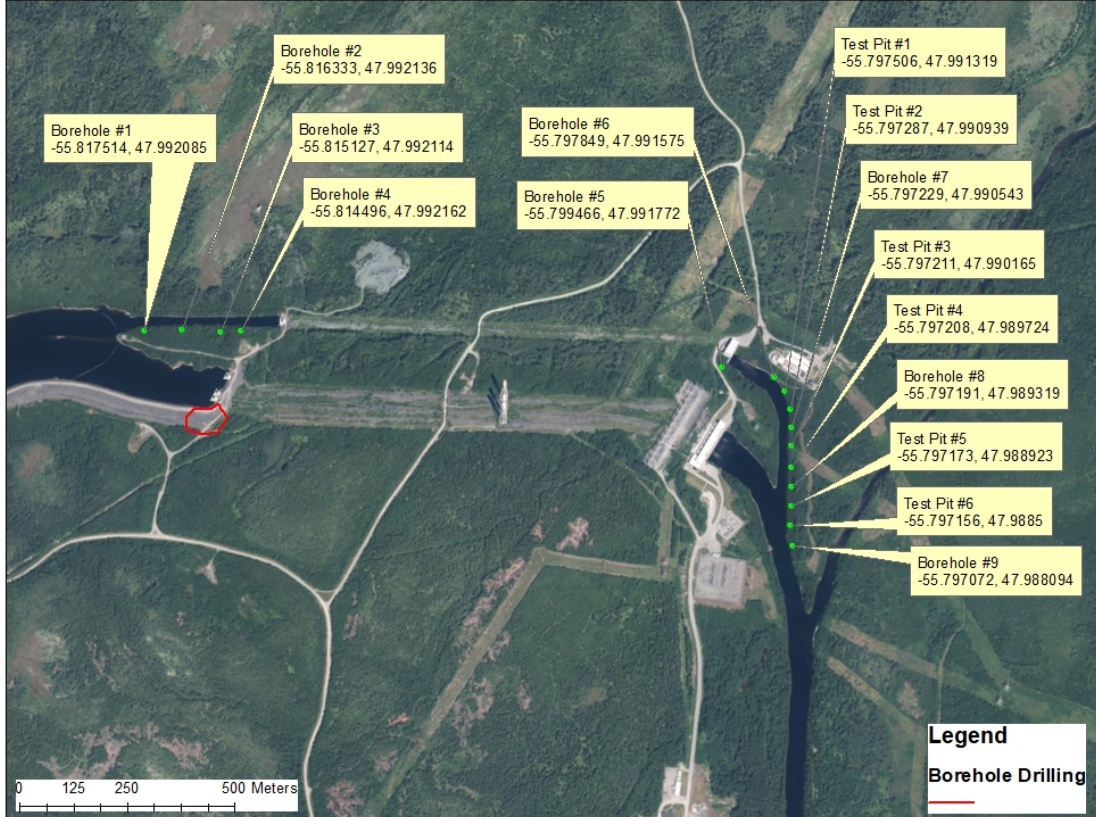
Bay d'Espoir Generating Station (Jeddore Lake/Unnamed Waterbody) - Geotechnical Investigation