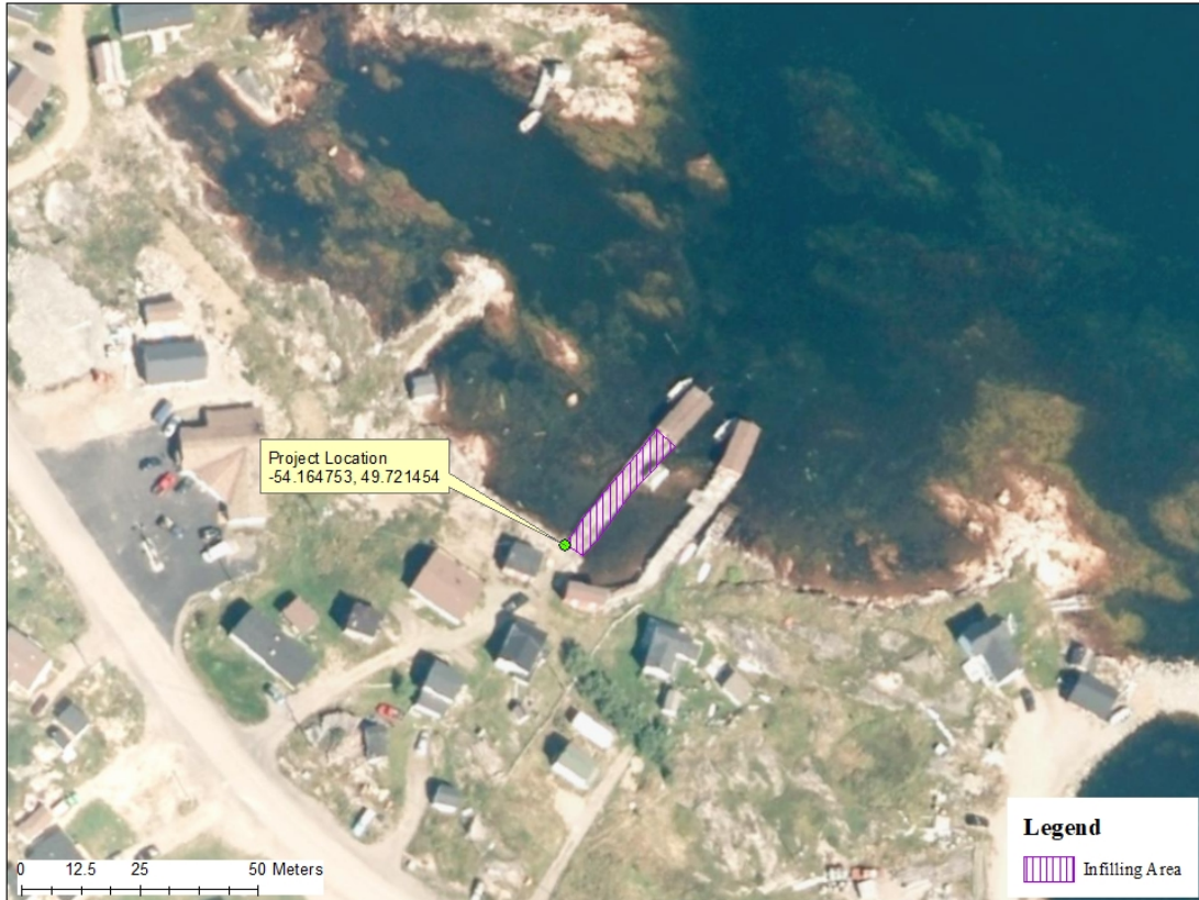
Town of Fogo Island (Joe Batt's Arm) - Wharf Demolition & Infilling