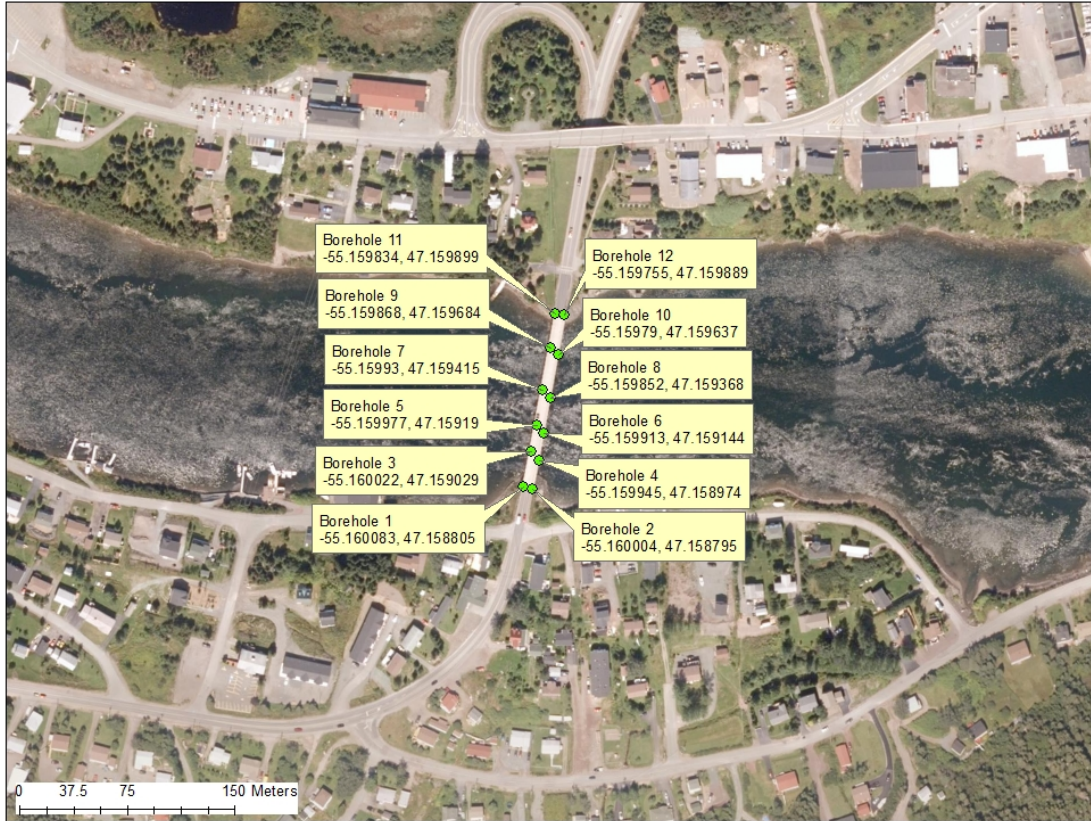
Town of Marystown (The Narrows) - Geotechnical Investigation for Marystown Harbour Bridge