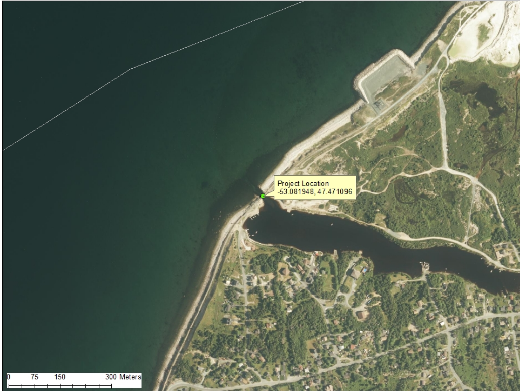
Seal Cove T'Railway Bridge Replacement