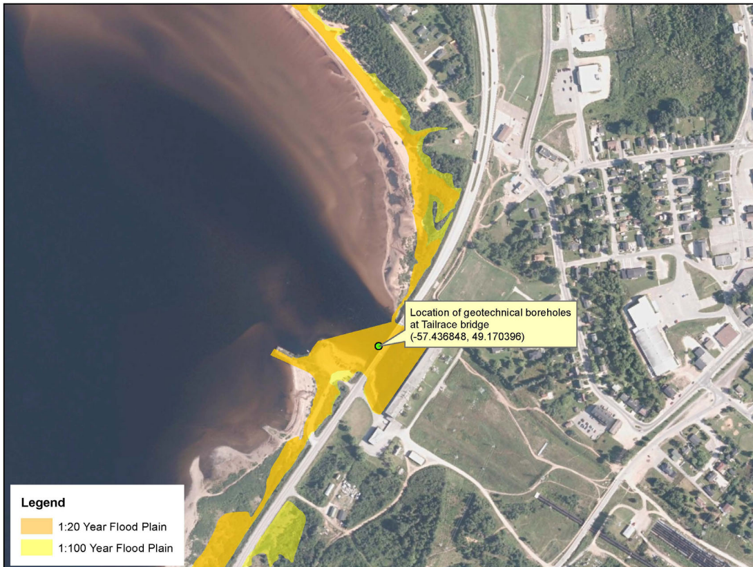
Geotechnical borehole drilling at the downstream of the Tailrace bridge in Deer Lake