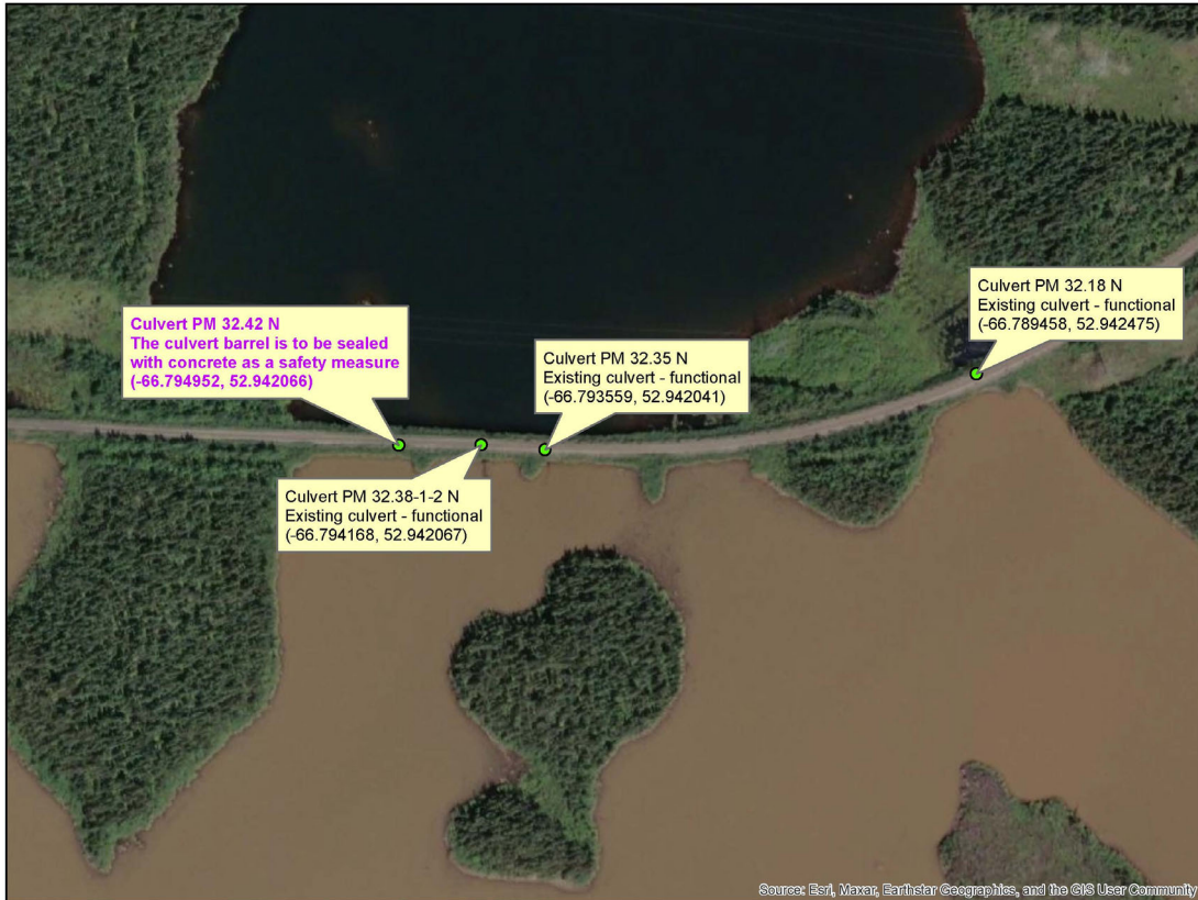
Urgent concreting of culvert (PM N-32.32 under the railway track in Shabogamo Lake, Labrador