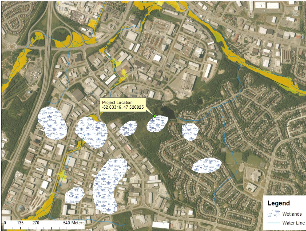
Powers Pond - Boardwalk Replacement