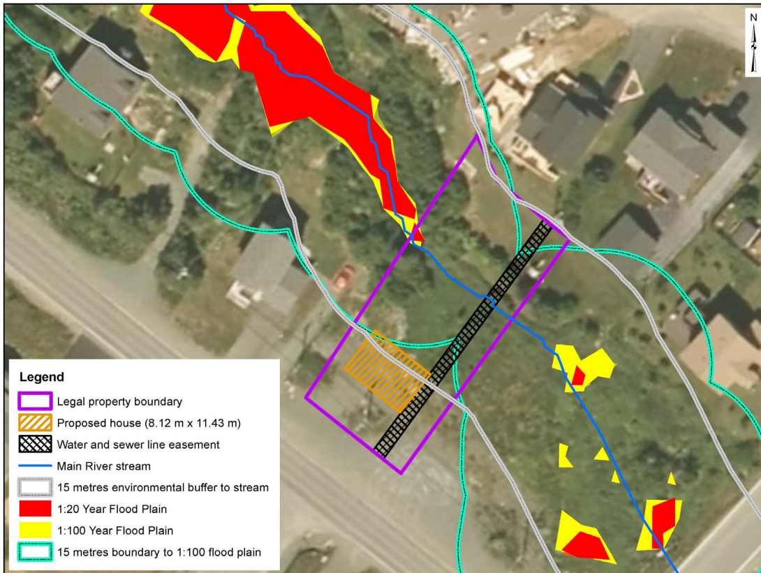
Construction of Residential Dwelling at 1566 Portugal Cove Road, Portugal Cove-St. Philip's