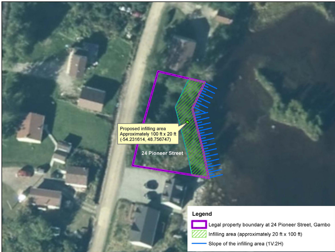
Infilling at 24 Pioneer Street, Gambo to Build Residential Dwelling