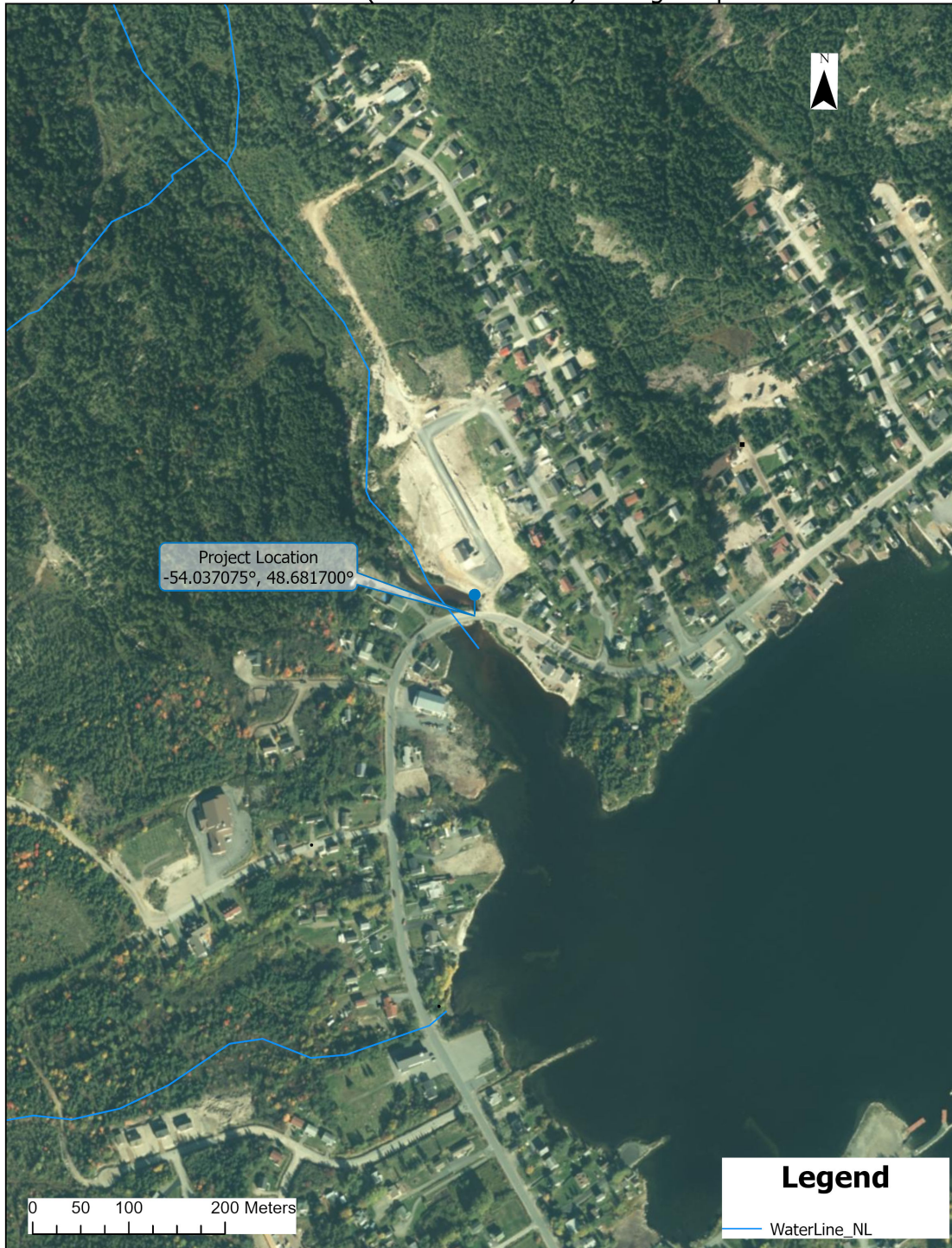
Town of Glovertown (Northwest Brook) - Bridge Replacement