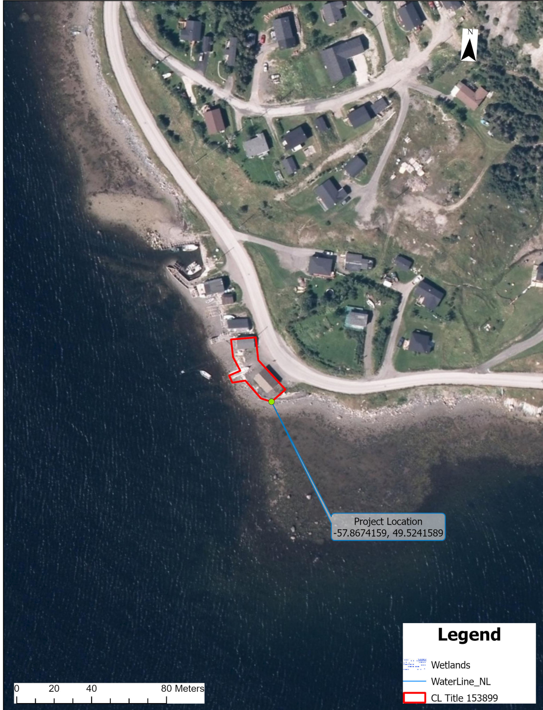
Town of Norris Point (Neddy Harbour) - Retaining Wall Demolition and Land Grading