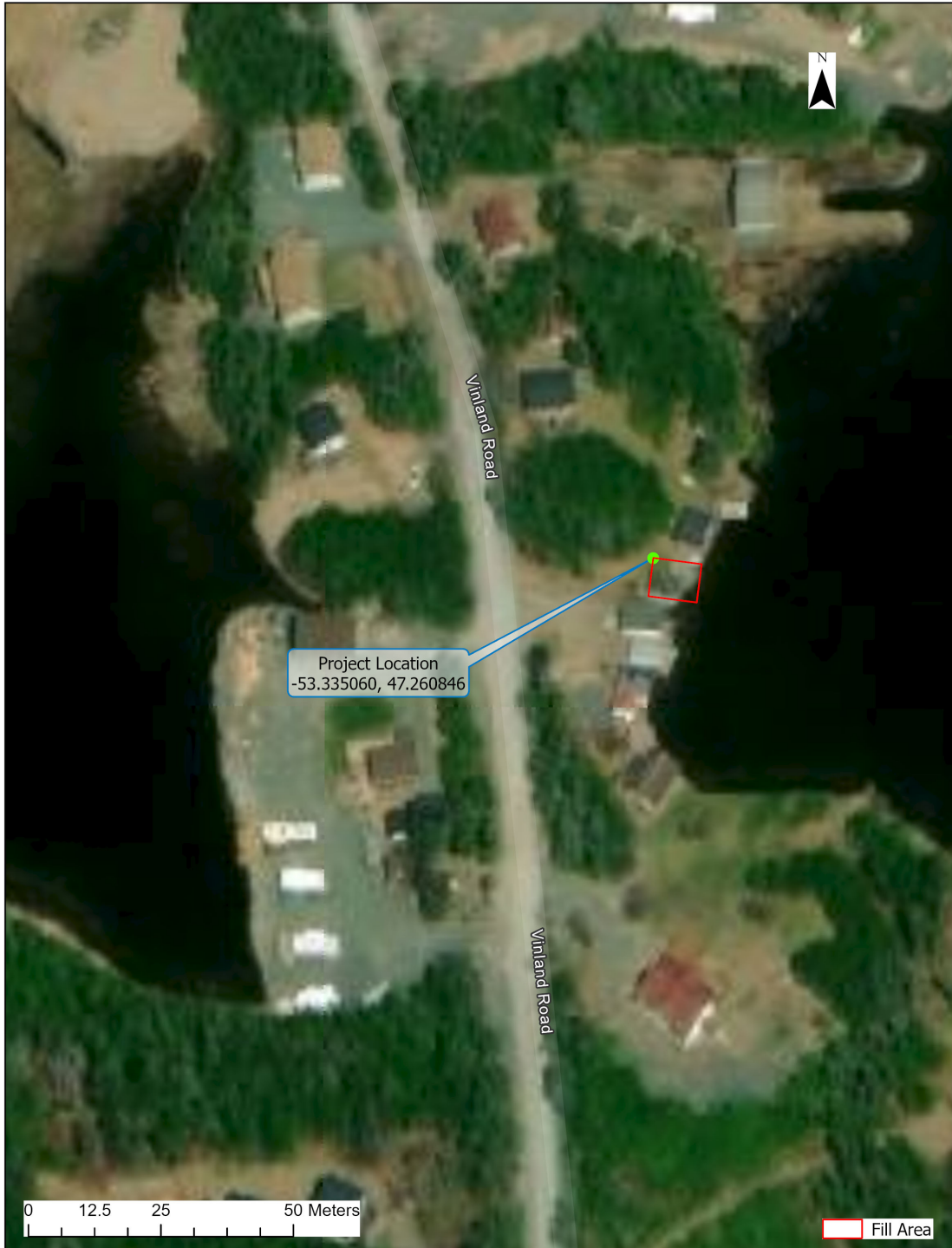
Little Gull Pond - Structure Demolition and Pond Access