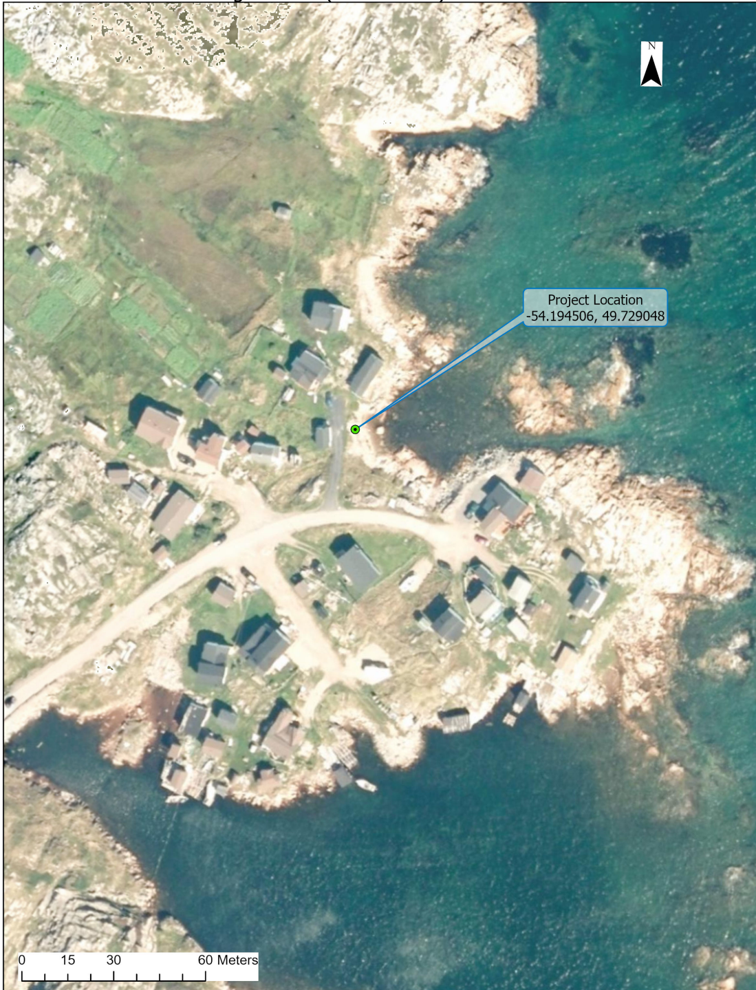
Town of Fogo Island (Barr'd Cove) - Shoreline Protection