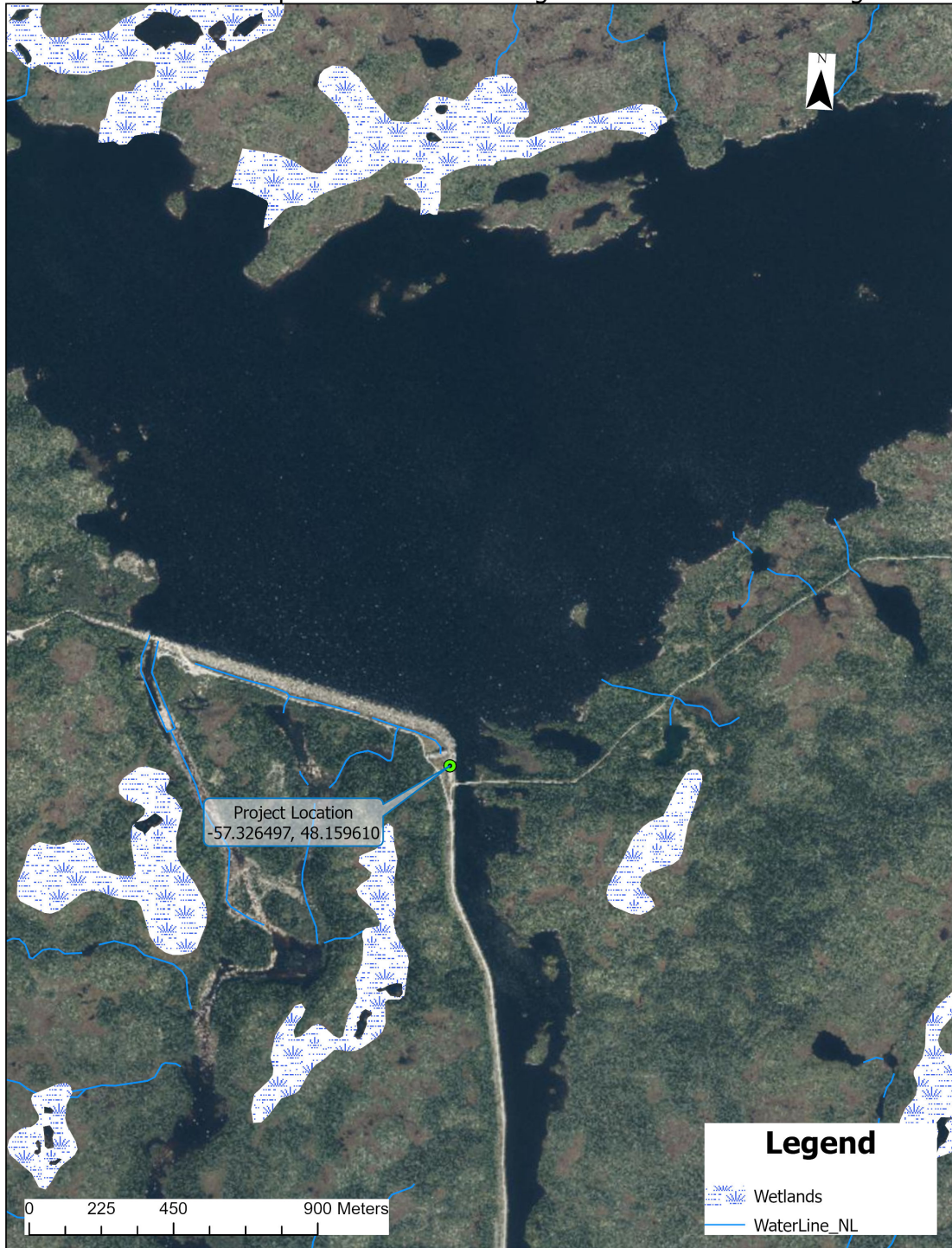
Burnt Dam - Replacement of Fuse Plug Protective Timber Cribbing