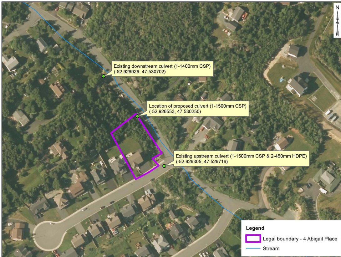
Culvert installation at 4 Abigail Place to access the property from Monument Road, Conception Bay South