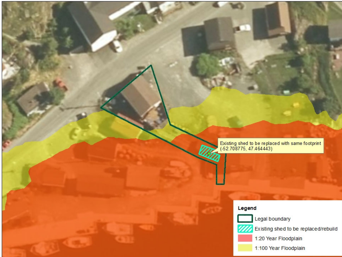
Replacement of an existing shed at 32 Main Road, Petty Harbour