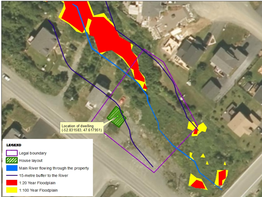
Construction of a house at 1558 Portugal Cove Road, Portugal Cove-St. Philip's