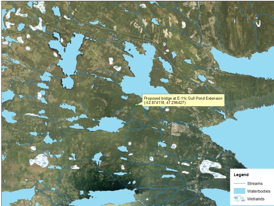
Proposed bridge construction at E-11c Gull Pond Extension, Gull Pond Resource Road, Witless Bay