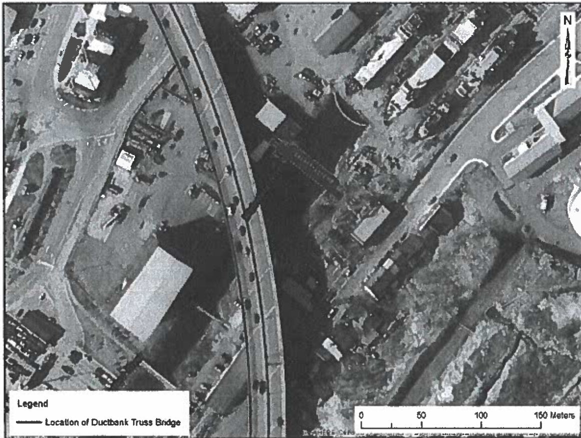
Ductbank Truss Bridge at Southside Road Dockyard across Waterford River