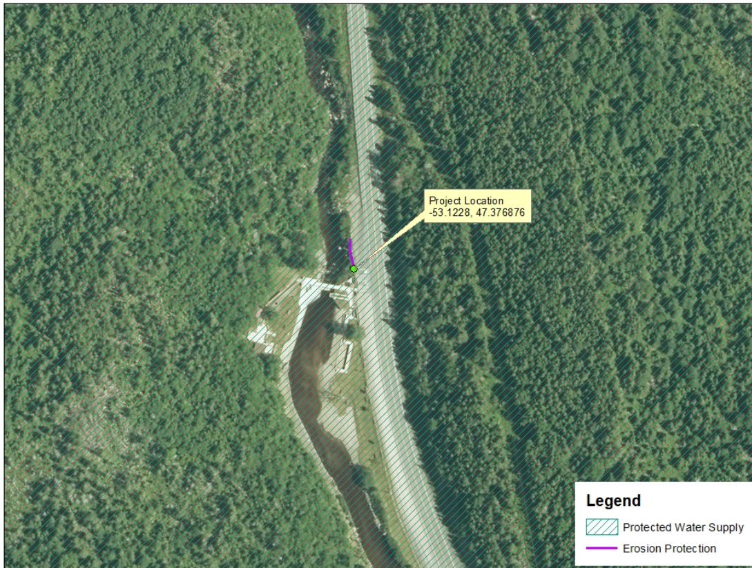
Town of Holyrood (Mahers River) - Erosion Protection