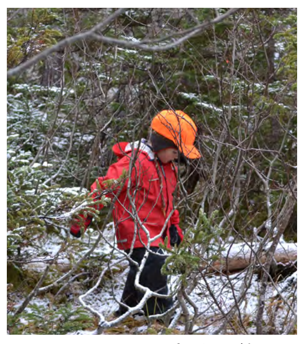
Ouestions and Answers 7

The public is invited to make recommendations during public consultations about management of hunting, fishing and trapping in the proposed reserve.