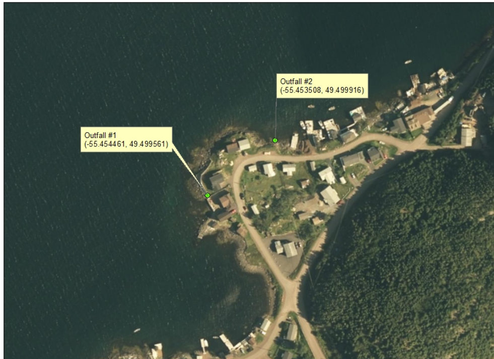
Sanitary Sewer Outfalls in Leading Tickles