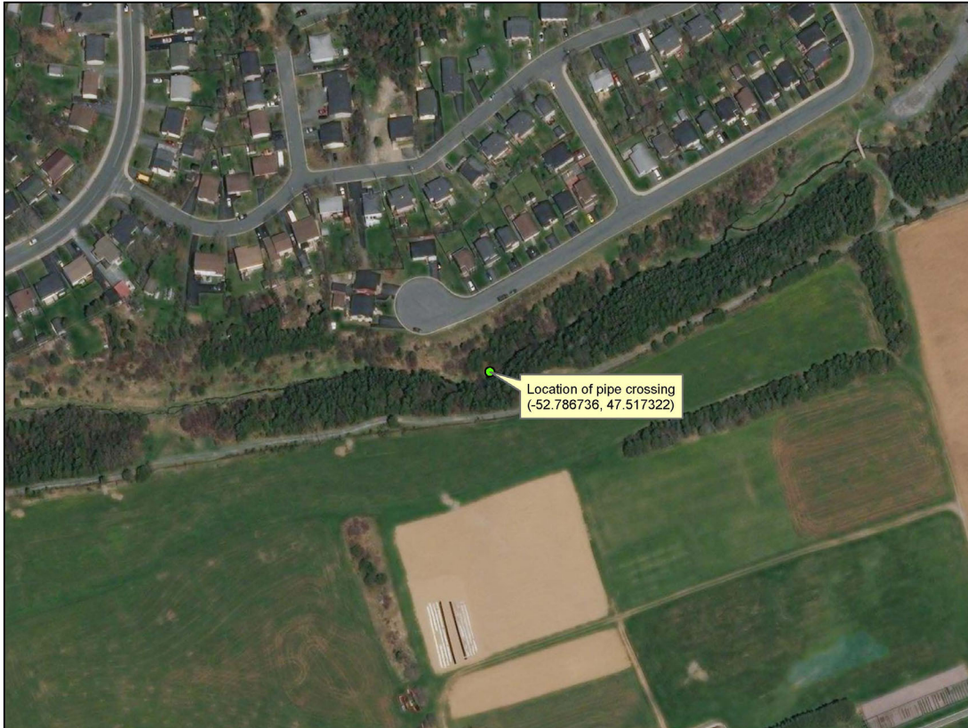
Pipe crossing in small tributary to the North of Flynn's Brook