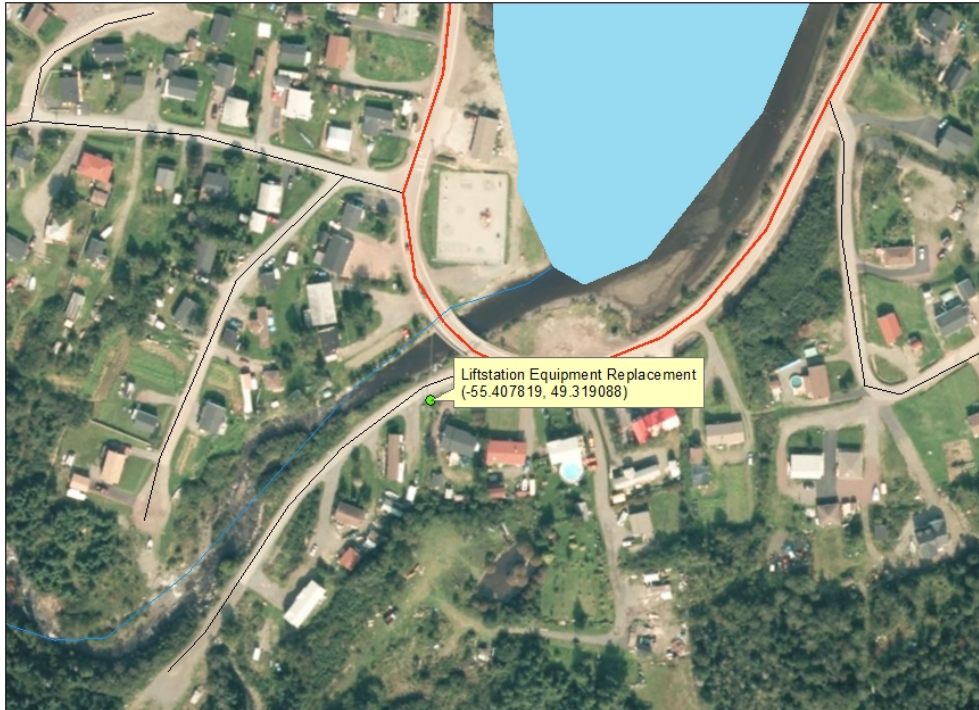
Liftstation Equipment Replacement Near Bottom Brook, Southwest Arm, in the Town of Point Leamington