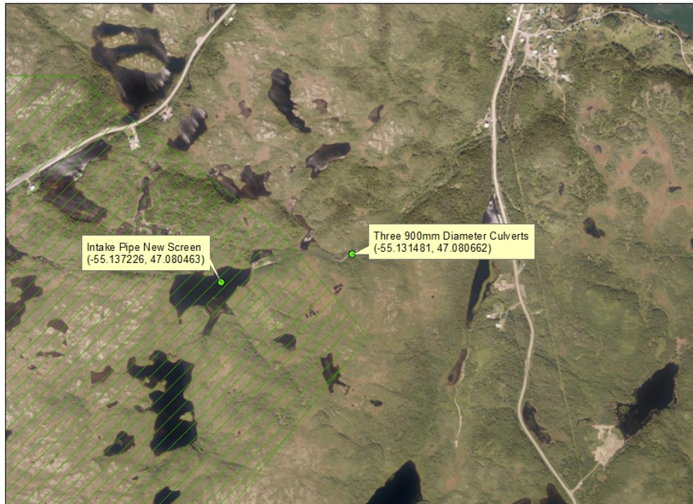
Water System Upgrades in the Town of Fox Cove - Mortier