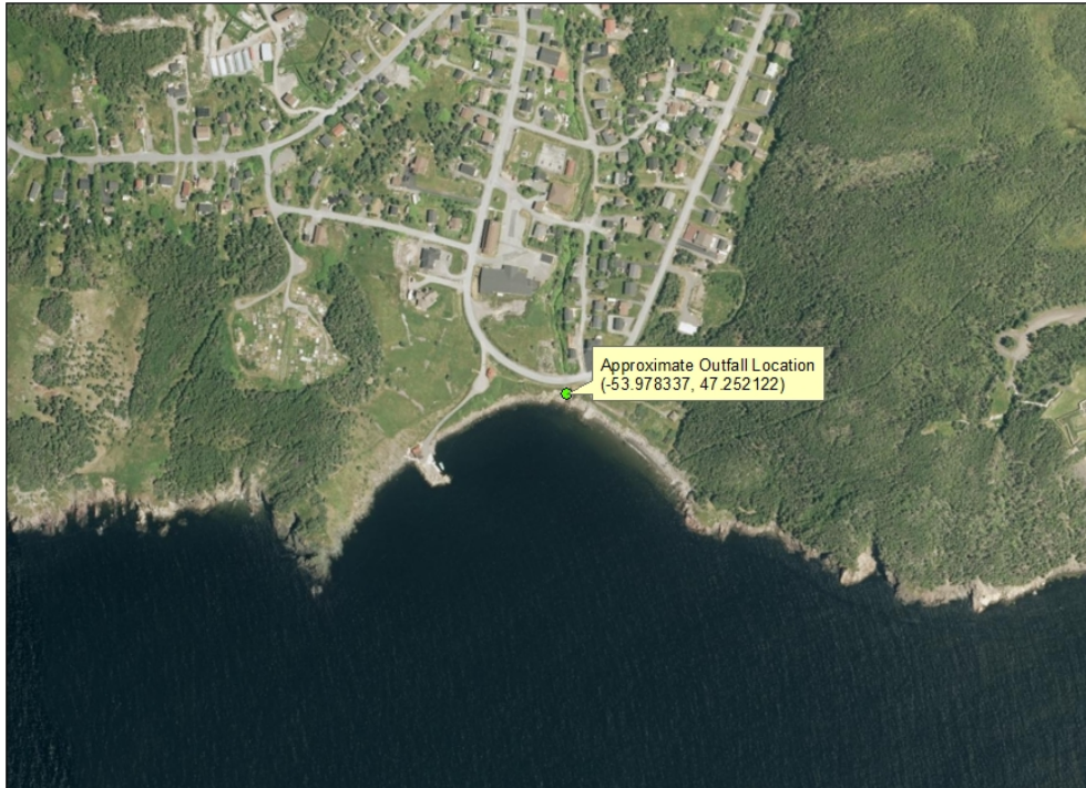
New Outfall on Freshwater Crescent in the Town of Placentia