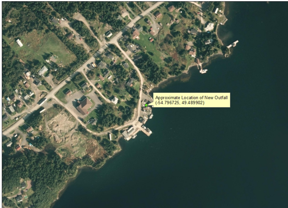
Storm Water and Sewer Outfall Near Wharf Loop Road in the Town of Summerford