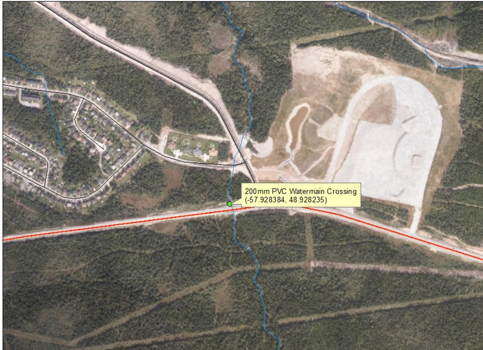
Pipe Crossing of Watson's Brook in Corner Brook