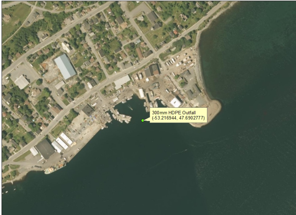
New Outfall in the Town of Harbour Grace