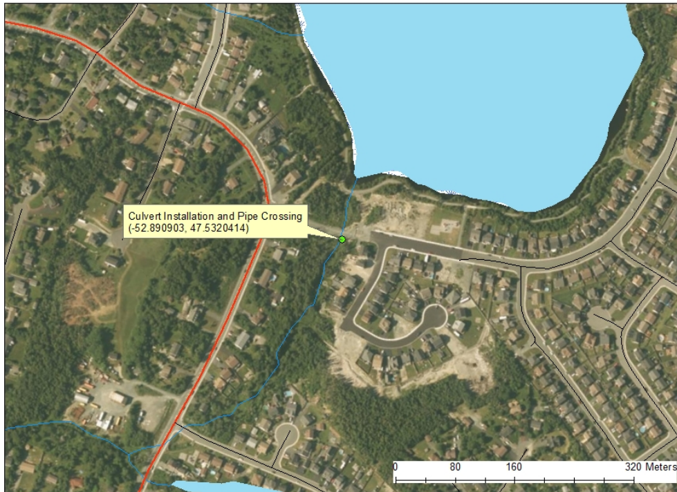
Lake Wynds Subdivision