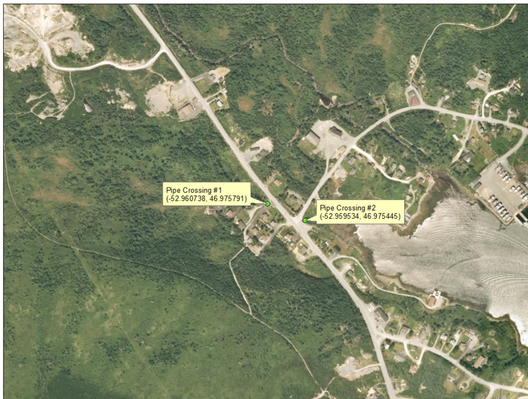
Fermeuse Sanitary Sewer Upgrades