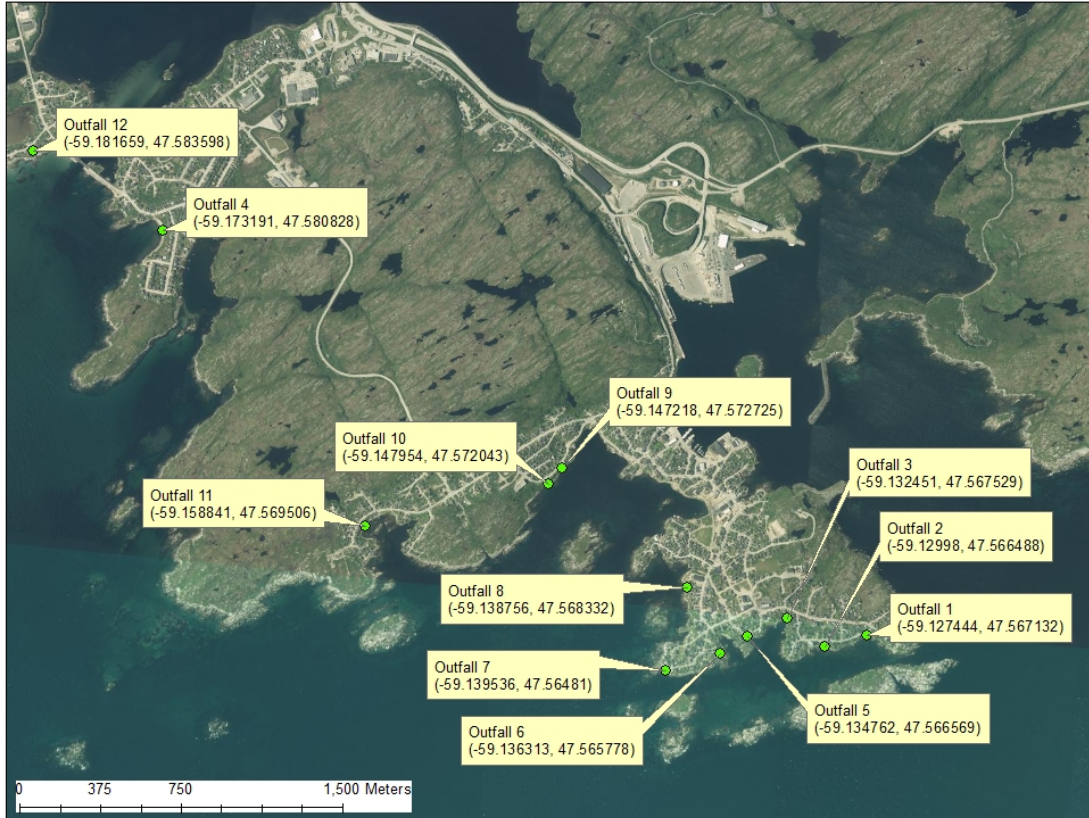
Channel - Port aux Basques Sewer Outfall Restoration